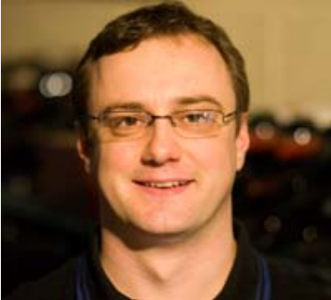
Reviewed by Neal Martin Sept 2009

HOT OFF THE PRESS! HOT OFF THE PRESS! HOT OFF THE PRESS!